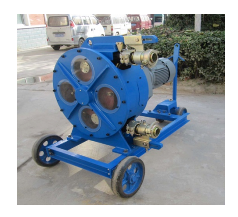
Peristaltic pump for foam concrete

These mobile peristaltic or hose pumps are equipped with more powerful electrical motors than other on the market, allowing it to pump the lightweight foam concrete at full capacity without interruption to long distance and high height. It is an excellent product for specific applications of cast-in-situ houses, roof heating isolation, floor screeding and levelling, underground void filling, etc