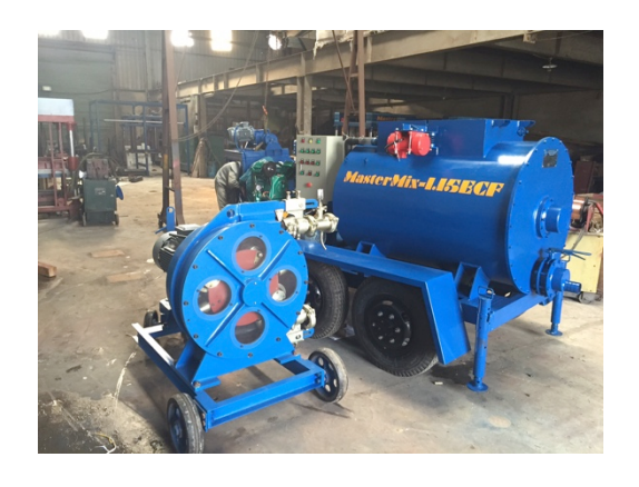
Clc pump and mobile mixer