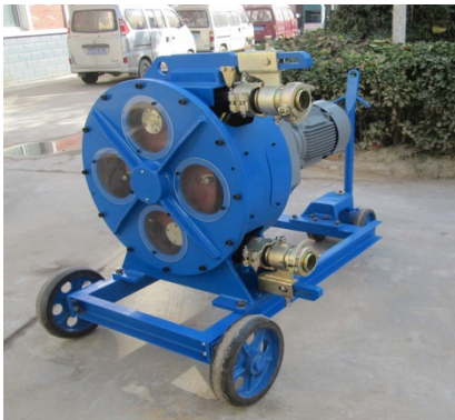
Peristaltic pump for foam concrete

These mobile peristaltic or hose pumps are equipped with more powerful electrical motors than other on the market, allowing it to pump the lightweight foam concrete at full capacity without interruption to long distance and high height. It is an excellent product for specific applications of cast-in-situ houses, roof heating isolation, floor screeding and levelling, underground void filling, etc