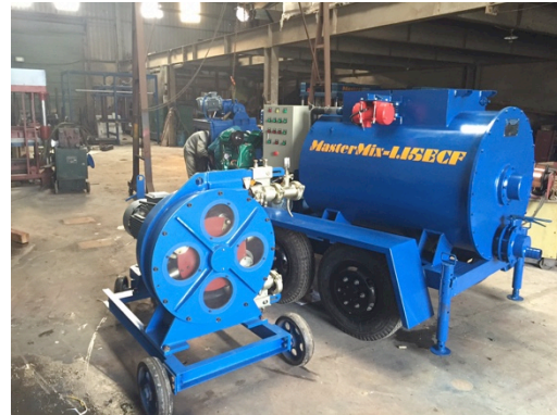
Clc pump and mobile mixer